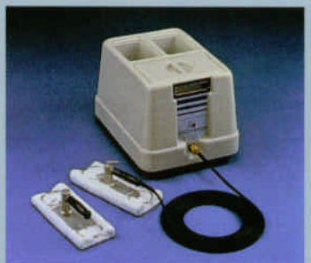
VS3 "Sanitizing Machine" Power Wall Cleaning System

VONSCHRADER CANADA 130 Industrial Avenue UNIT "B" Carleton Place, ON K7C 3T2 www.vonschradercanada.com Tel: (613) 257-5200 Fax: (613) 257-2324