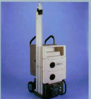
VersaTile TM Wall & Acoustical Tile Cleaning System