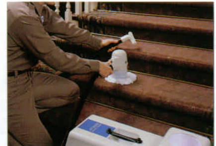
The "close quarters cleaning machine". It's a lifesaver for stairs, risers, landings, closets, bathrooms and other confined carpeted areas.

Easy to transport. New and handy slide-out handle extends for travel, then safely retracts out of the way. Also features durable front caster wheels that swivel for added mobility.