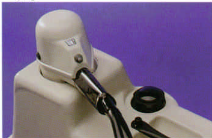
Convenient recessed Power Head storage compartment, keeps it within easy reach when not in use.

The Esprit™ System includes an easy to follow instructional videotape and a fully illustrated owner's manual. Plus: Von Schrader backs you all the way with a toll-free Technical Assistance Hotline to quickly answer any questions.