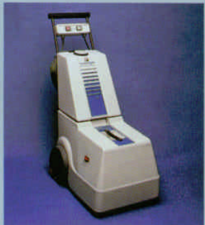
LMX Low Moisture Soil Extraction Carpet Cleaning System