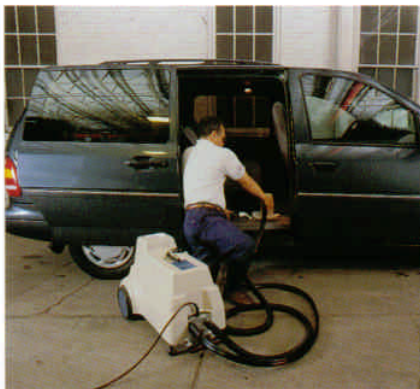
Won't soak the seats! Car, van, mobile home, RV, boat, aircraft seating and interiors can be effectively cleaned, with only minutes of drying time.