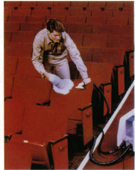
Theater, auditorium or meeting room seating for 20,200 or 20,000 are quickly and economically cleaned. Seating is ready again, fast.