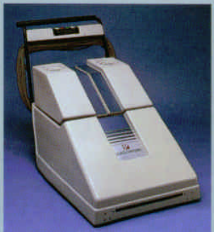
VS Mach 12 High Speed Extraction System