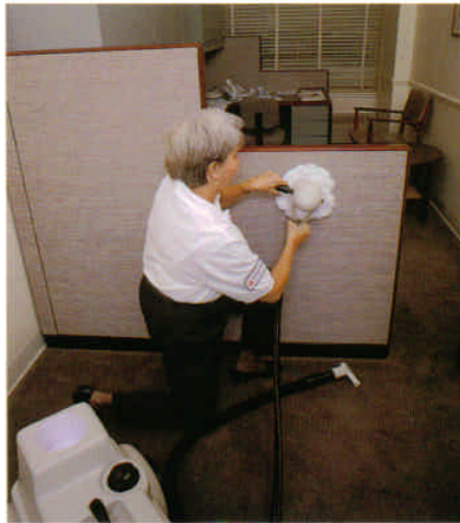
Fabric-covered office partitions are efficiently cleaned. Cleaning action is aggressive enough for heavily-soiled partitions, yet safe to prevent fabric separation damage from overwetting. (Optional side handle shown in operation.)