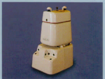
Dolphin TM Robotic Carpet Maintenance System